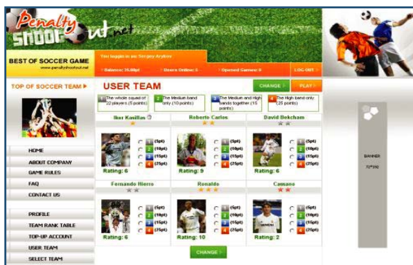
Picture 3. Penalty Game Site