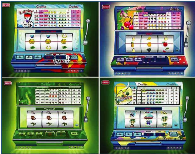
Picture 2. Flash Slot Machine