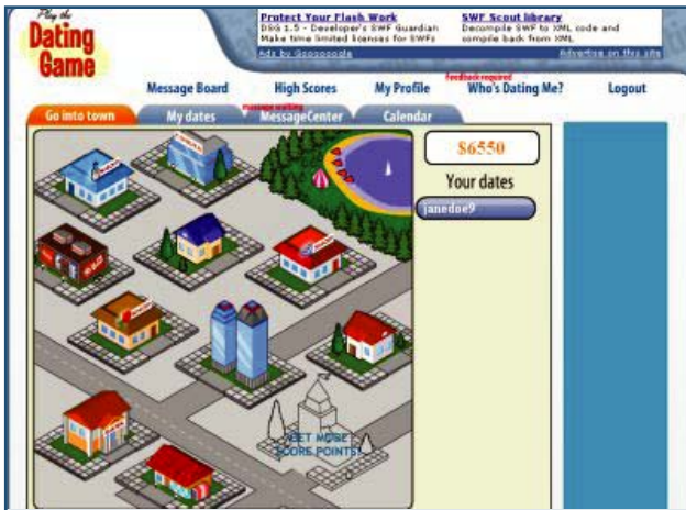
Picture 1. Play The Dating Game Site

It's one of projects using the rich internet application (RIA) development. Actually, RIA projects mean much more, than a simple flash development project.