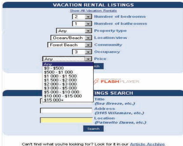
Pic. 2 Search Form

We developed a multi criterion search for Hilton Head site. There is compound logic implemented that supports full-text search. The search we developed allows working with various criteria from range of price and text search to choosing options. The search is word-oriented and guarantees the most relevant results.