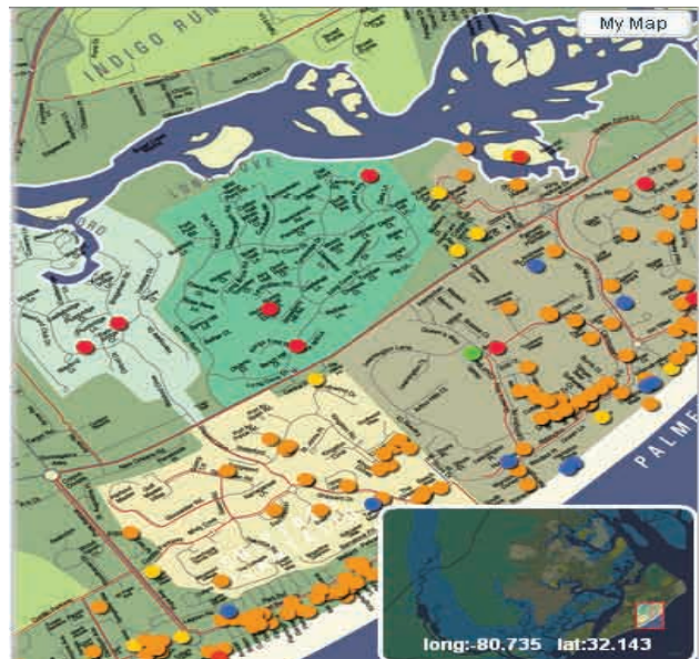
Pic. 4 Map

This Map is a separate project of Key-Soft's. It's done by means of flash technology. The Map uses the same database as a site.